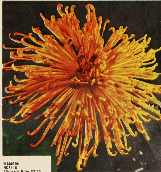
MAMORU NCF116 50c each 6 for $2.25